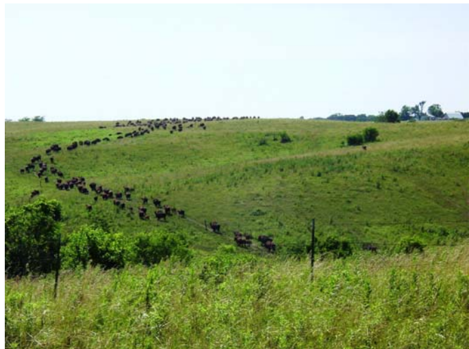
A herd comprised of primary and extended bison families trails across Jackson's ranch.

NEWEST.NET: So let's get this straight. You grow bison in family units, you make family structure the core element of your herd, and when you harvest or sell animals, your focus is on satellite family units that are offshoots of the main herd? Even when you cull animals for harvest, you identify self-confined families and then remove all of the members together?