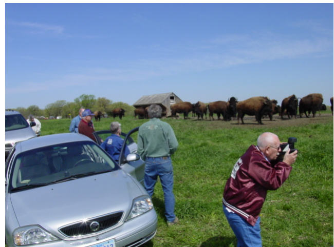
Jackson's Tall Grass Bison Ranch has become a tourist attraction and a place where agrarians hoping to get into the bison business can go to learn.

In reality, appreciating all of the parts together make up for a better whole.