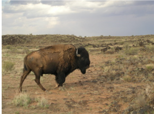
Caption

In autumn 2006, the Wildlife Conservation Society held a landmark conference in Denver on the future of North American bison. Among the questions being pondered by the large gathering of conservationists, scientists, wildlife officials from the U.S., Canada and Mexico, and representatives from the commercial bison industry was this: Should bison be listed as a federally-protected species in the U.S. and moreover, do they warrant placement on the IUCN's Red List as an imperiled animal in need of global focus?